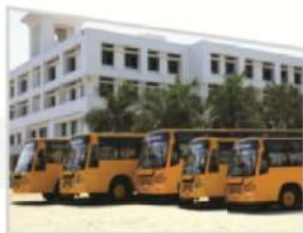
Adequate buses and vans for the convenient transportation of students