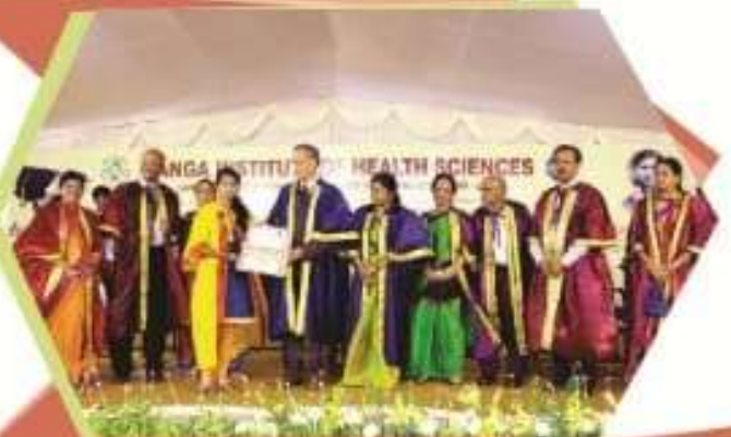
Endowing Scholarship to Best Performers