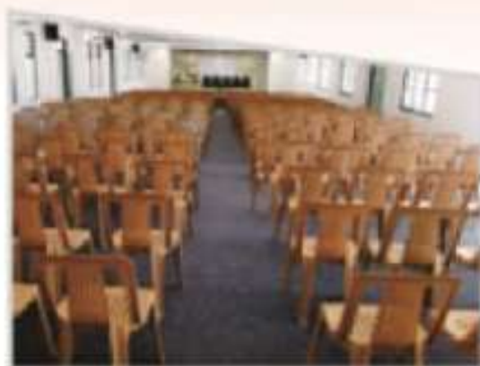
Air condition Auditorium with a capacity to hold 600 students at a time.