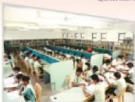
Well equipped library with National & International journals