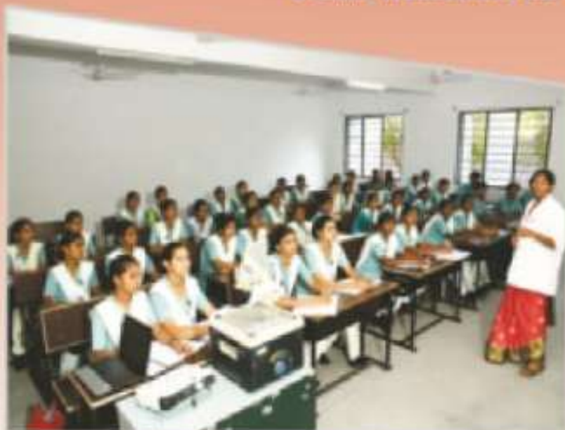
Spacious class room equipped with LCD and overhead projectors