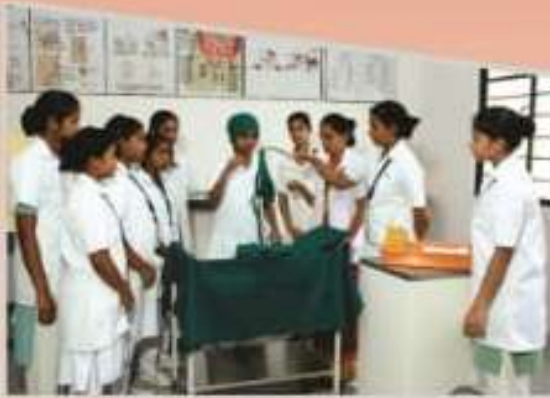
「Foundation of Nursing Lab」