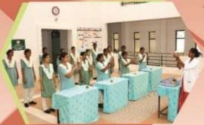
Evidence Based Nursing