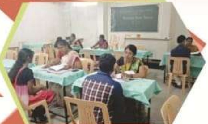
Preceptorship Training for Slow learners