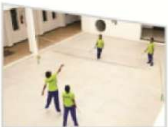
Indoor Tennis Court