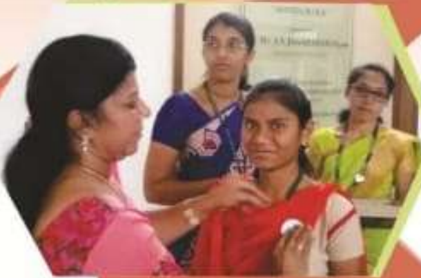
Awarding Best Clinical Performer & Presenter