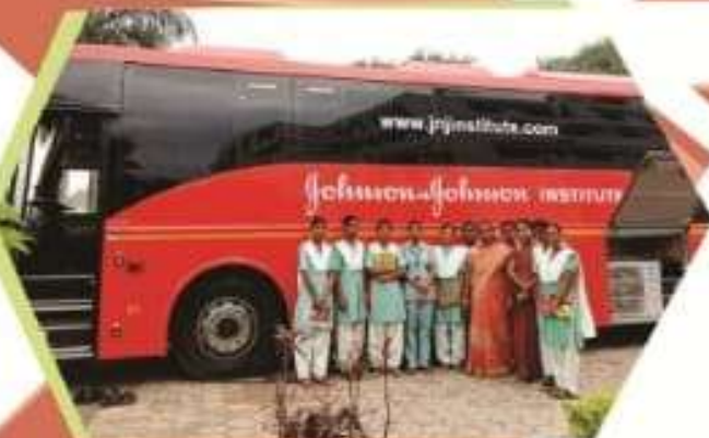
Simulated Surgical Clinical Training