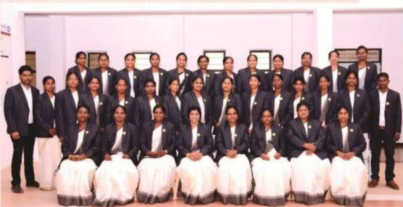
Faculty Ganga Institute of Health Sciences

Best wishes for augmented success to encircle you in the years to come.