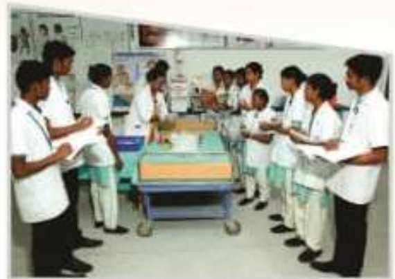
「Child Health Nursing Lab」