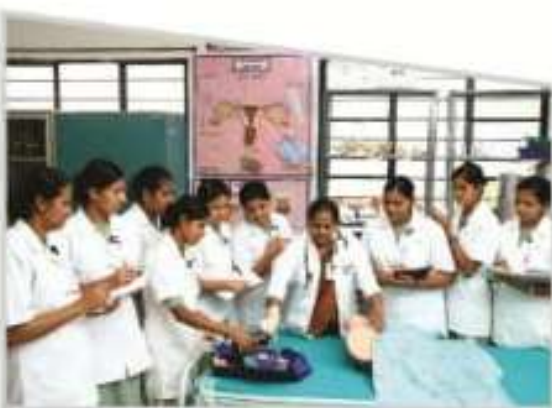
「Obstetrical and Gynecological Nursing Lab」